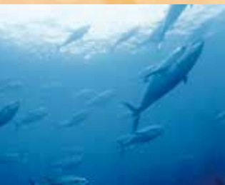
Kindai bluefin tuna