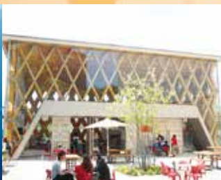
E 3 [e-cube] The Village-English, Enjoyment, Education