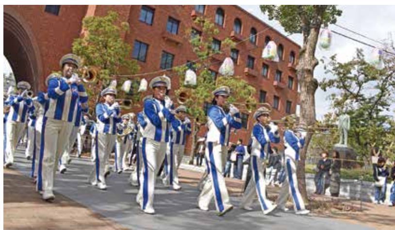
▲ The Kindai University Band is marching in the campus.