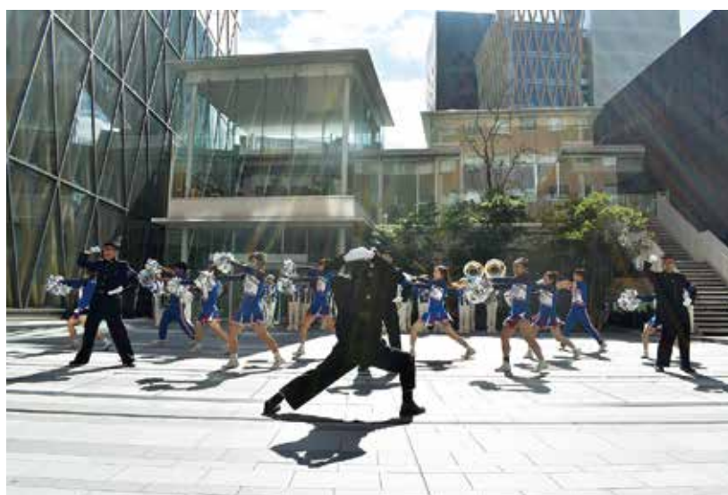
▲ The Kindai Cheerleading Squad at the “Opening Ceremony”