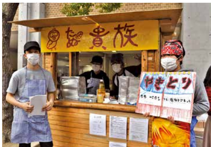
▲ A carefully crafted stall