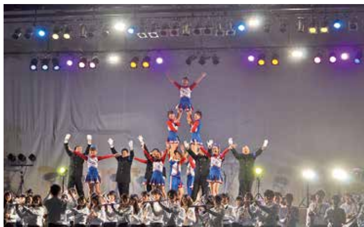
▲ Two clubs are performing joint performances