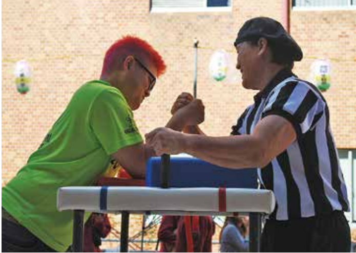
▲ A participant challenging a wrestler and a wrestler enjoying the battle