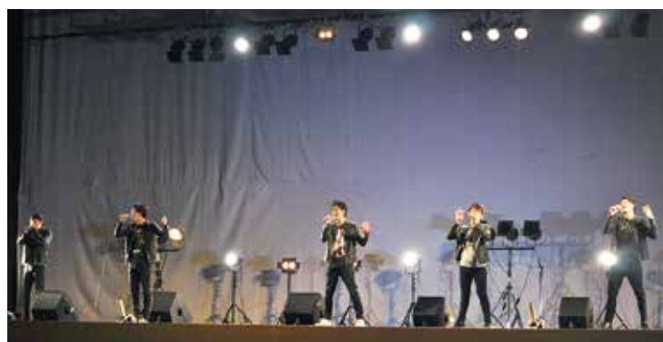
▲ Acapella club “Over Scale” are performing acapella