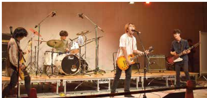
▲ “Light at hands” sets the stage alight with a powerful performance.

On Friday, November 2, “IKOMA ROCK FESTIVAL” was held in Memorial Hall. Four sets bands played. “Asayake ha itsumo” took first prize.