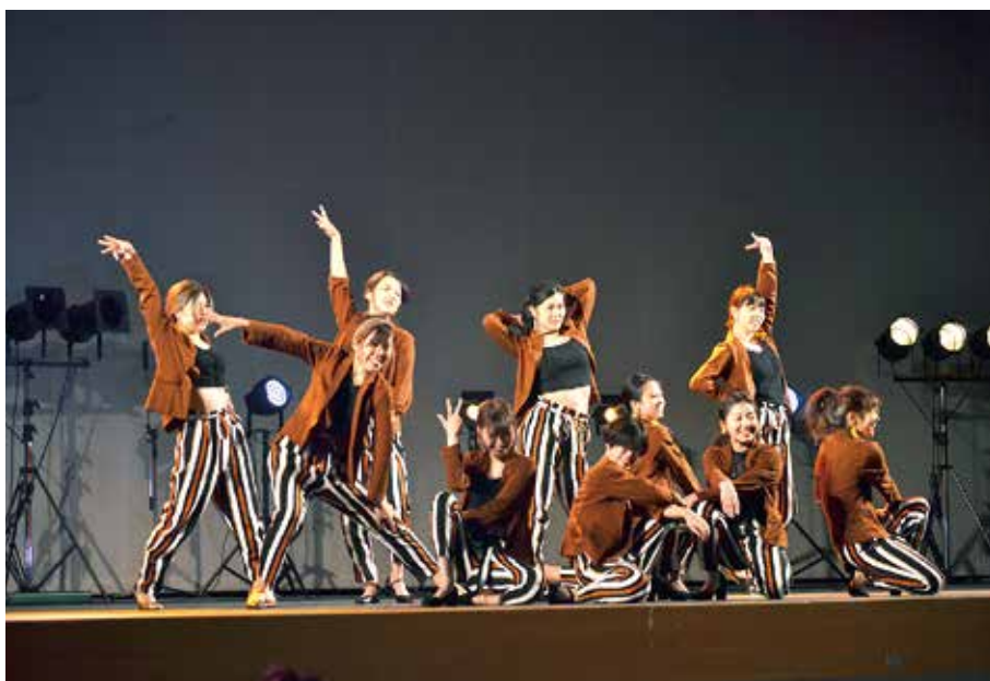
▲ “Croissant” posing with big smiles