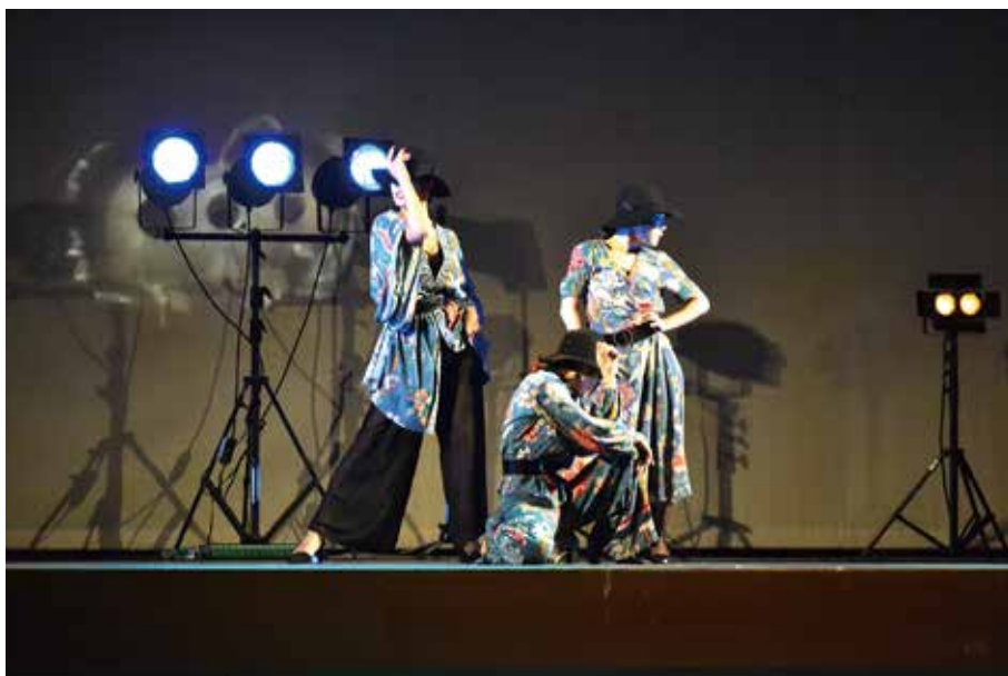
▲ “zeruch” won for the second time in a row.