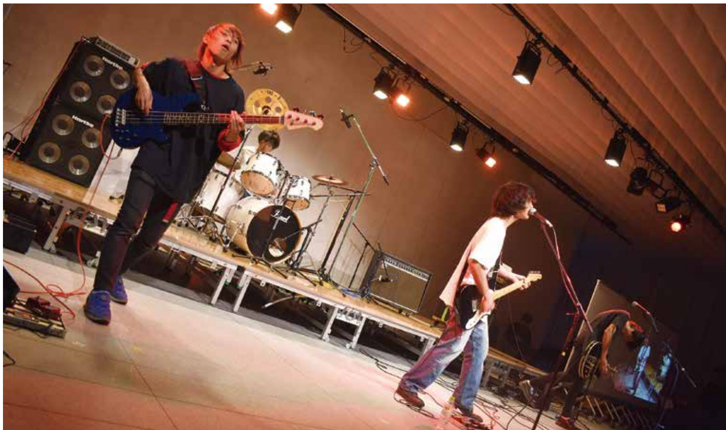
▲ “Asayake ha itsumo” is the winner of “IKOMA ROCK FESTIVAL”.