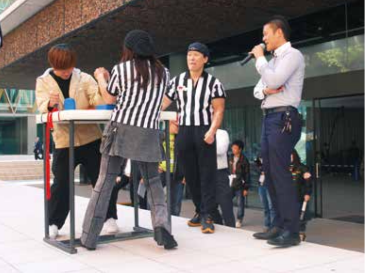
▲ A participant won 5 times in a row, and he challenges a wrestler.