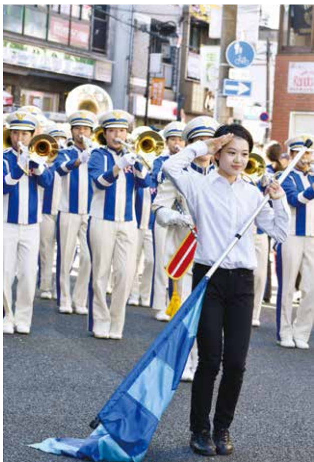
▲ A flag bearer is saluting in front of the Kindai University Band.

On Friday, November 2, the 70th Ikoma Festival “Opening Parade” was held from Nagase Station to Kindai University at 10:00 a.m. The “Opening Ceremony” was held by the Study Hall at 11:50 a.m.