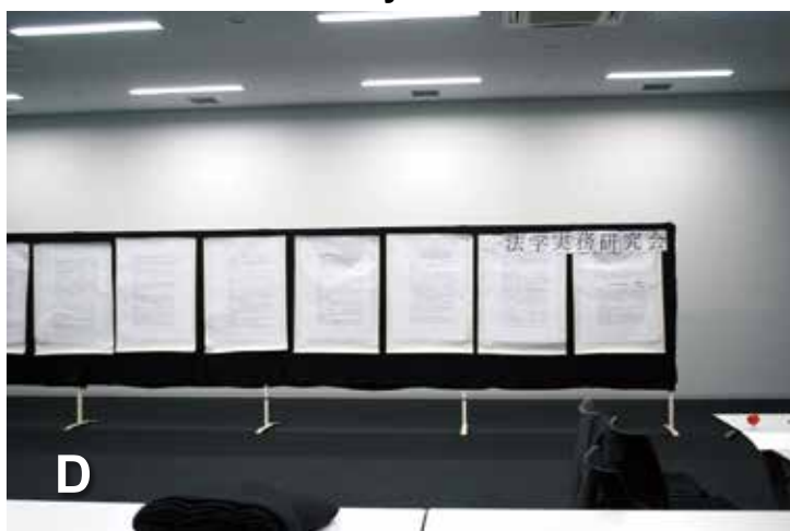
Faculty of Law