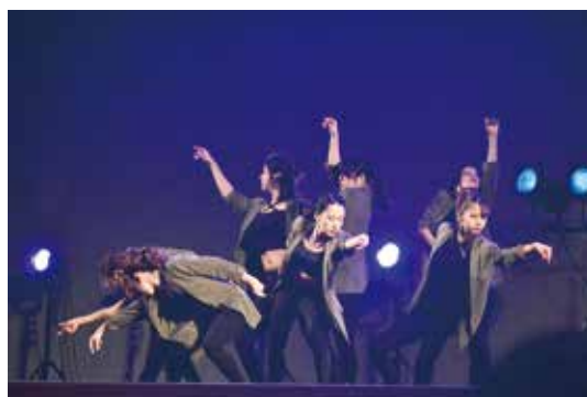
▲ Movement in perfect synchronicity

On Saturday, November 3, Kindai Dance Festa -Dizzy- was held at Memorial Hall by the Ad Studying Society. 15 dance groups competed. The champion was selected by a vote from the audience. The winning group was “zeruch”.