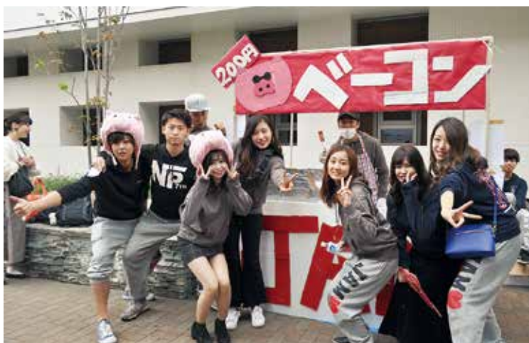
▲ Some members wearing pig headgear and selling bacon