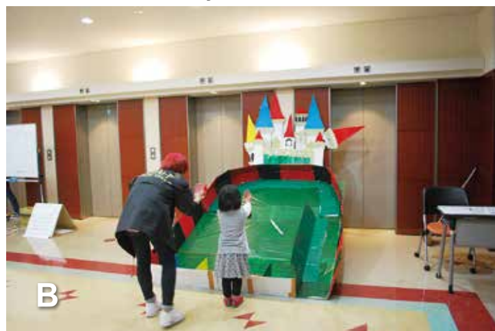
Faculty of Economics