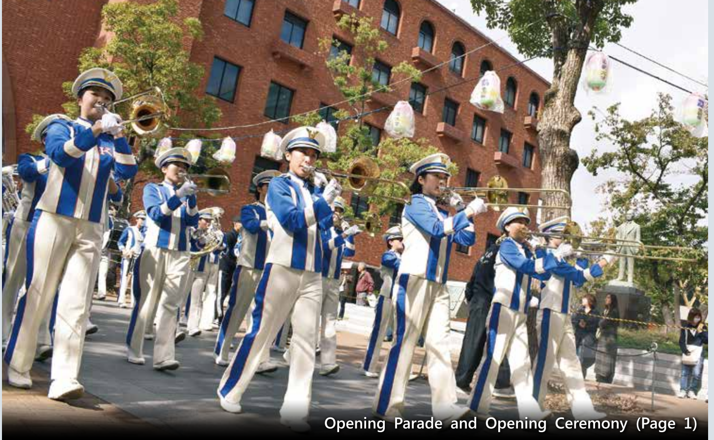
Opening Parade and Opening Ceremony (Page 1)