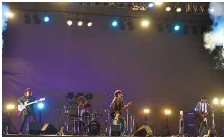
▲ “Asayake ha itsumo” are singing.

On Sunday, November 4, “Grand Finale ~Legend of Soul~” was held in Memorial Hall at the end of the 70th Ikoma Festival. The champions of each event gathered together and did performances.