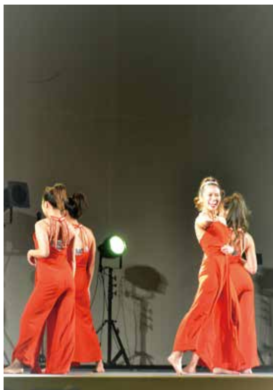
▲ “Magudols” are members of The KINDAI GIRLS.

On Saturday, November 3, Kindai Dance Festa -Dizzy- was held at Memorial Hall by the Ad Studying Society. 15 dance groups competed. The champion was selected by a vote from the audience. The winning group was “zeruch”.