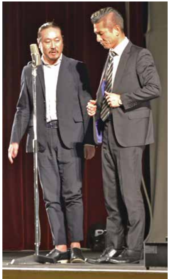
▲ The manzai of Waraimeshi