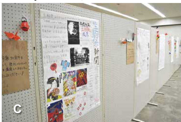
Faculty of literature, Art and Cultural Studies