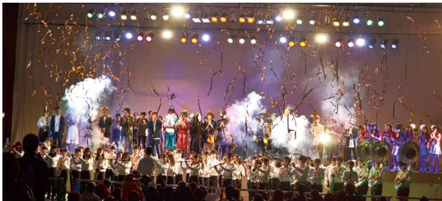
▲ “Grand Finale” is drawing to a close.