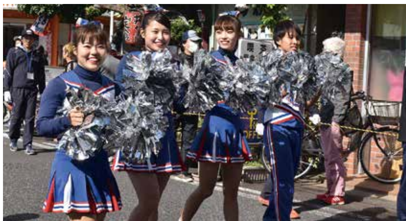
▲ Cheerleaders are walking down Kindai street.

On Friday, November 2, the 70th Ikoma Festival “Opening Parade” was held from Nagase Station to Kindai University at 10:00 a.m. The “Opening Ceremony” was held by the Study Hall at 11:50 a.m.