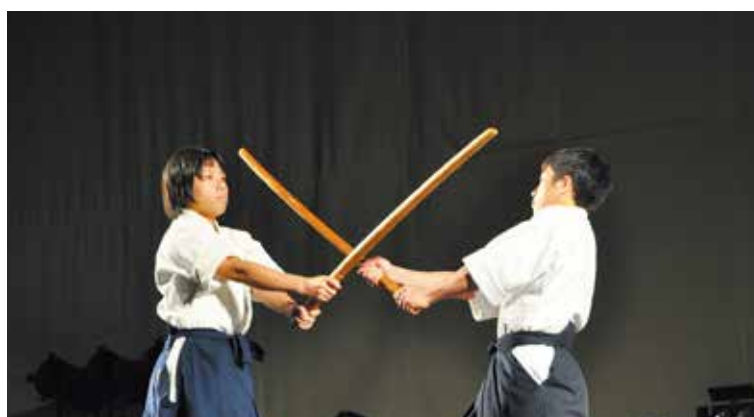
▲ Members of the Aikido Club are performing the program called “Kumi-tachi” using short wooden swords.

Akitsukiembu was held in Memorial Hall. Four clubs of Aikido , Iaido , Pharmacy Japanese Fencing and Naginata participated in the event. Members from each club showing off their skills.