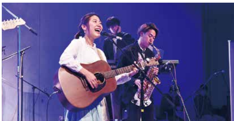
▲ Performances included many genres. A performer blowing on his saxophone