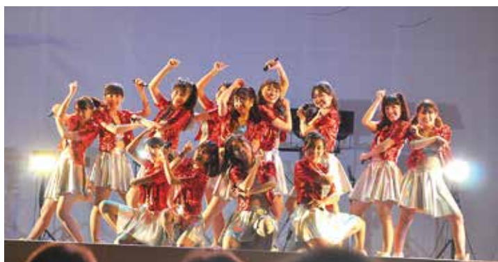
▲ They won “Atsumare! idol zuki people ~odorimakure~”. Their name is “Kindai Musume. 18 from KINDAI GIRLS”.