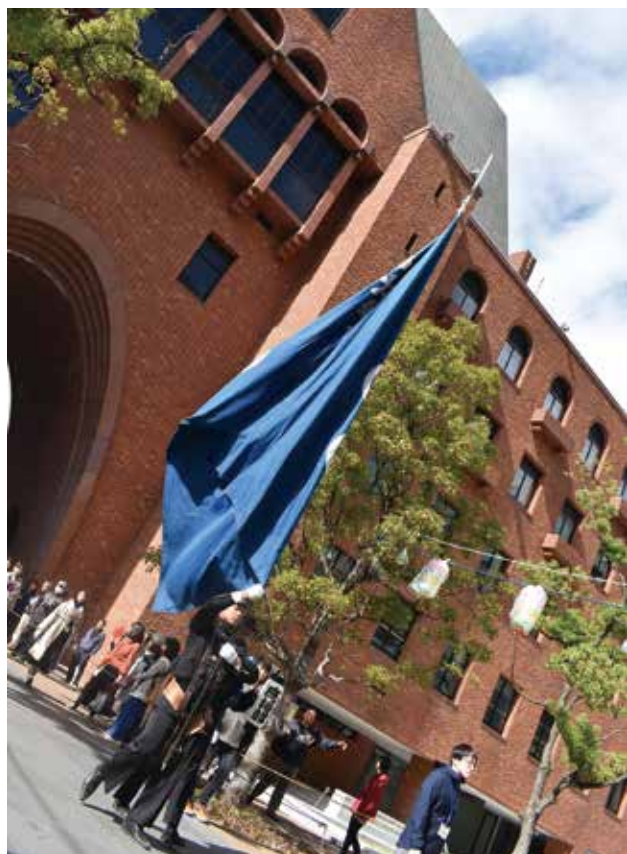
▲ The Kindai flag is flying.