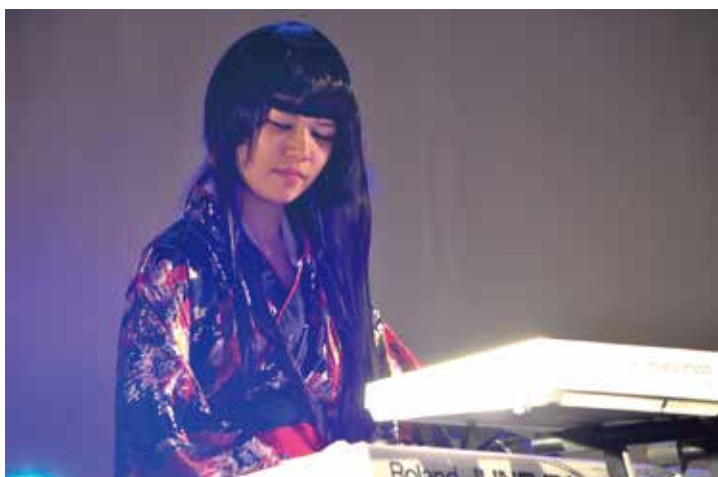
▲ “sinh 6 \times 10^{12} (Zero)” is playing the last performance.