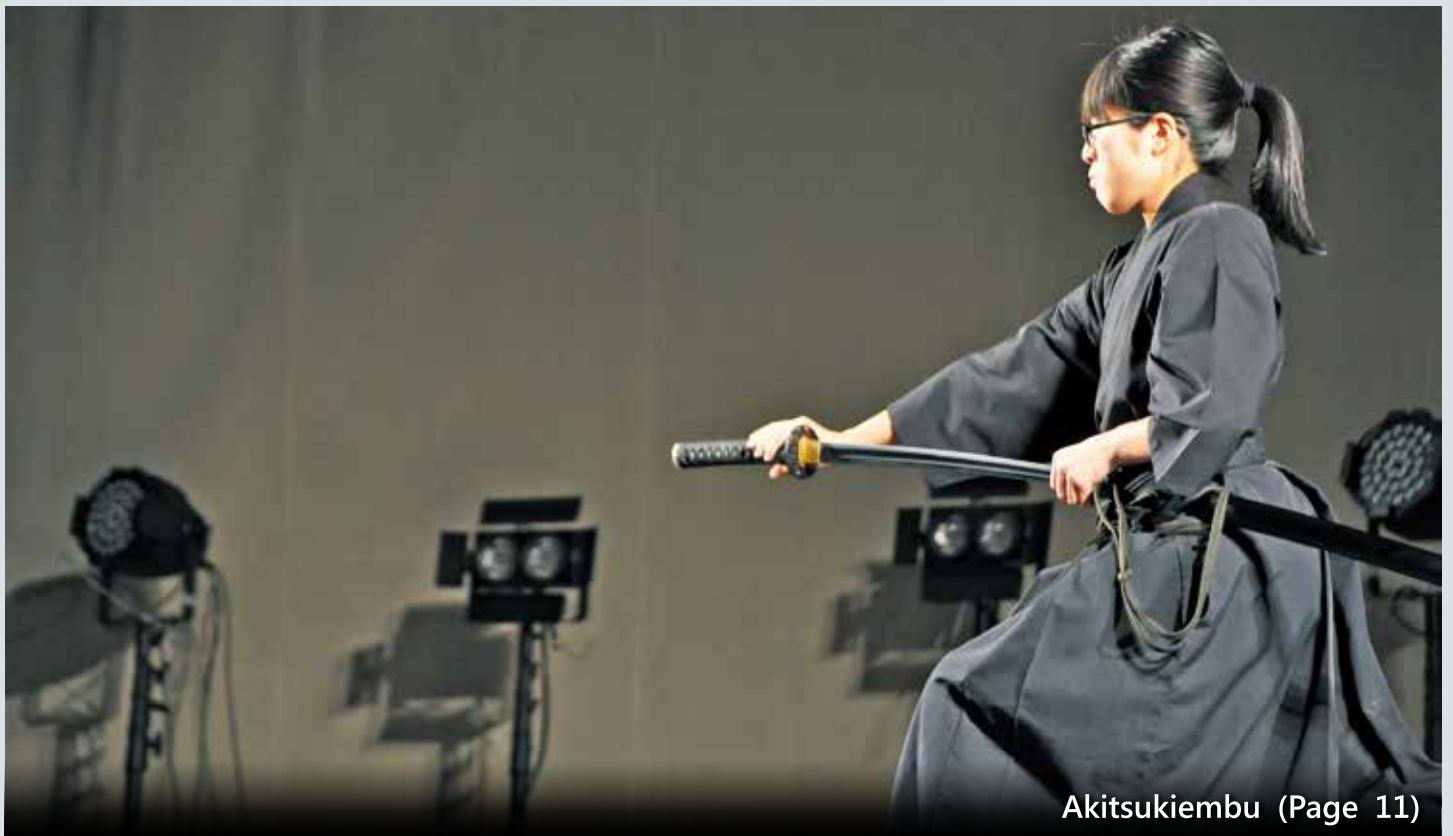
AkitsuKiambu (Page 11)