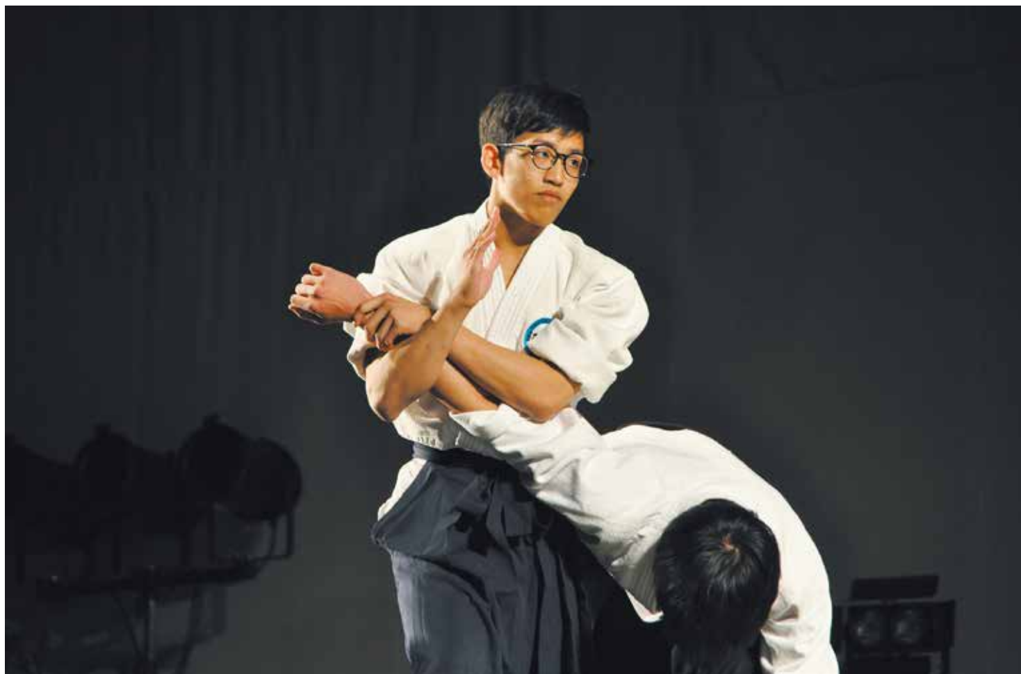
▲ A member of the Aikido Club performing a technique