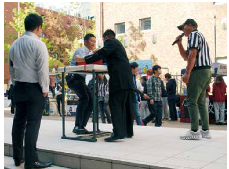
▲ A wrestler and a participant in the black suit engaged in battle.

On Friday, November 2, an arm wrestling event was held the Study Hall at Kindai University. People from The Japan Arm Wrestling Association participated in the event. The wrestlers surprised both project managers and participants with their massive bodies and strength.