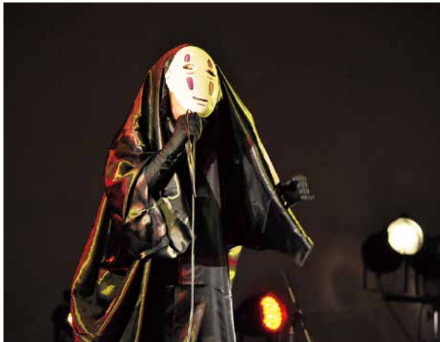
▲ A vocalist cosplays No-Face, who comes on Spirited Away ( Sen to chihiro no kamikakushi ).