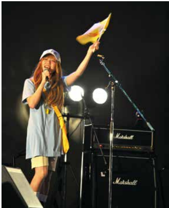
▲ A vocalist performs in a costume of Platelet, Cells at Work!