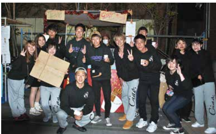
▲ Members of the general sports club “Ciao” selling churros