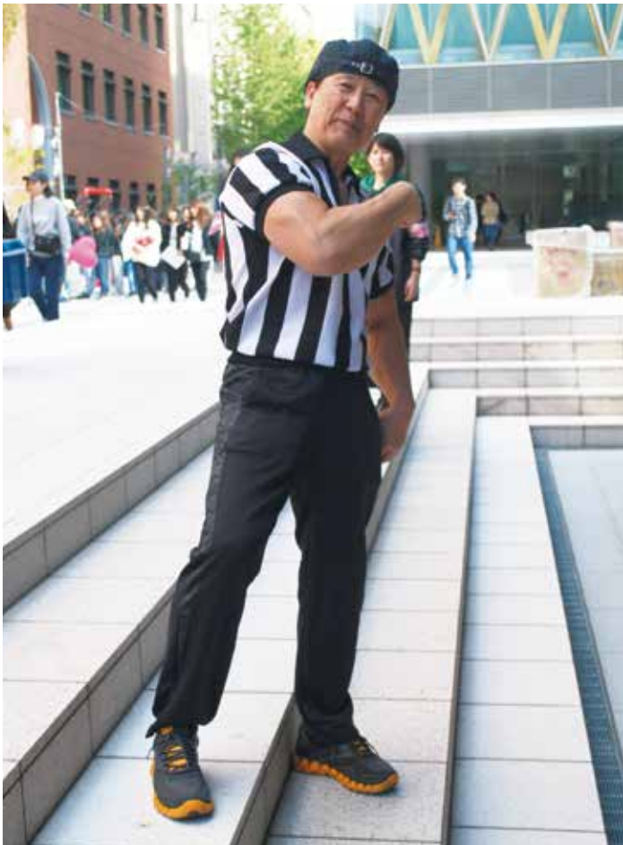
▲ A powerful member of The Japan Arm Wrestling Association