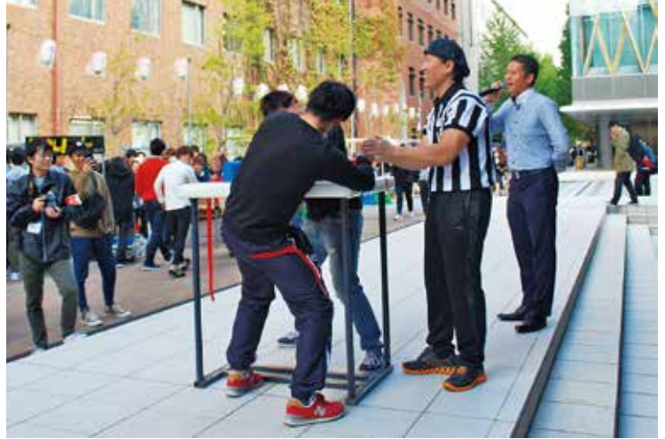
▲ Participants in battle. Win 5 times in a row and receive a prize.