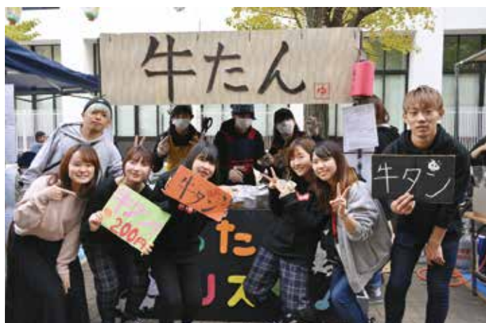
▲ Beef tongue is on sale.