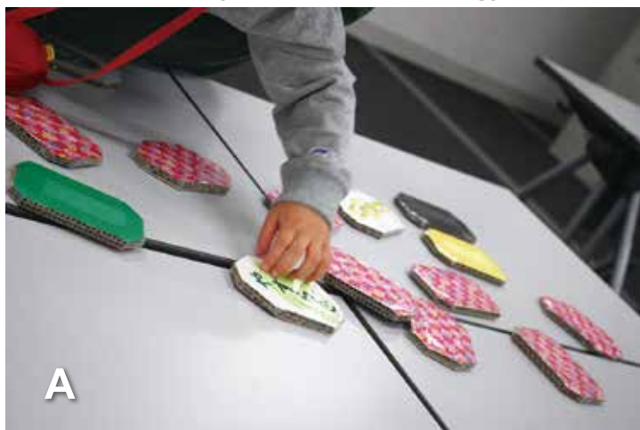
Faculty of Applied Sociology