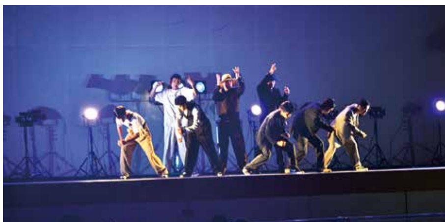
▲ All-male group “FUNKSTA”