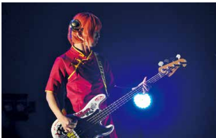
▲ A bassist performs in a costume of Kagura, who is the character of Gin Tama .

On Friday, November 2, at Memorial Hall, WOTA-ON Parade vol. 8 was held. This event of otaku , by otaku , for otaku turned out to be a great success. The audience enjoyed the event with distributed penlight.