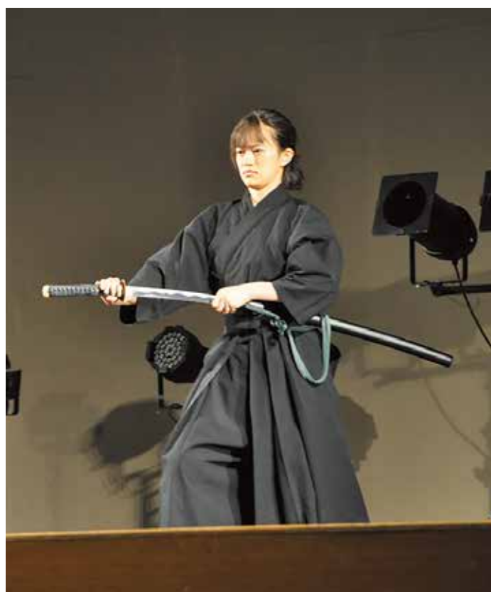
▲ A member of the Iaido Club sheathing a sword