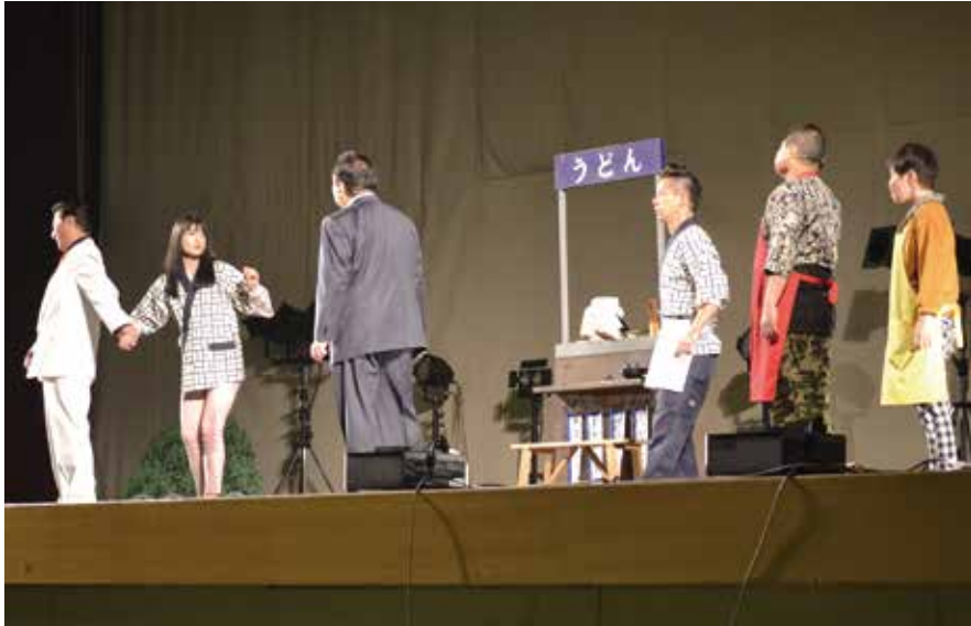
▲ A scene of Yoshimoto Shinkigeki

On Sunday, November 4, an Owarai event featuring Yoshimoto comedians performed at Memorial Hall. The event was held in three parts: Yoshimoto Shinkigeki , Manzai and a talk show. Many men and women of all ages filled the hall with laughter.