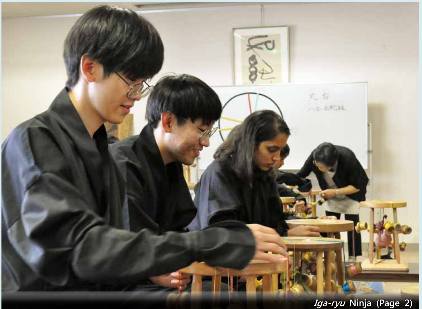
Iga-ryu Ninja (Page 2)