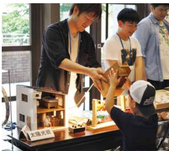
◀ Network of the Educational Demonstration about Energy's staff is explaining "solar power generation" to a participant.

On Sunday, May 21, The Kindai Science Festival 2017 was held in November hall by Student Study Groups from The School of Science and Engineering.