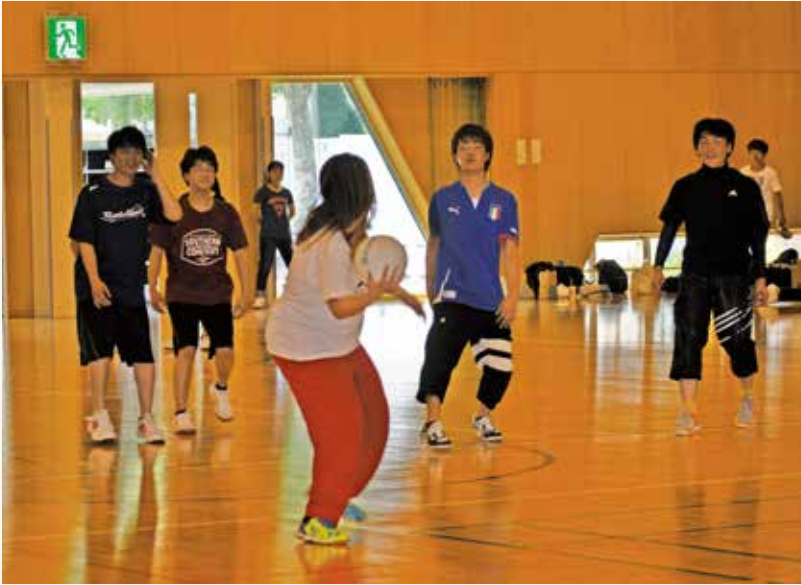
Dodgeball event. ▶

On Saturday, May 20, held by Faculty of Business Administration.