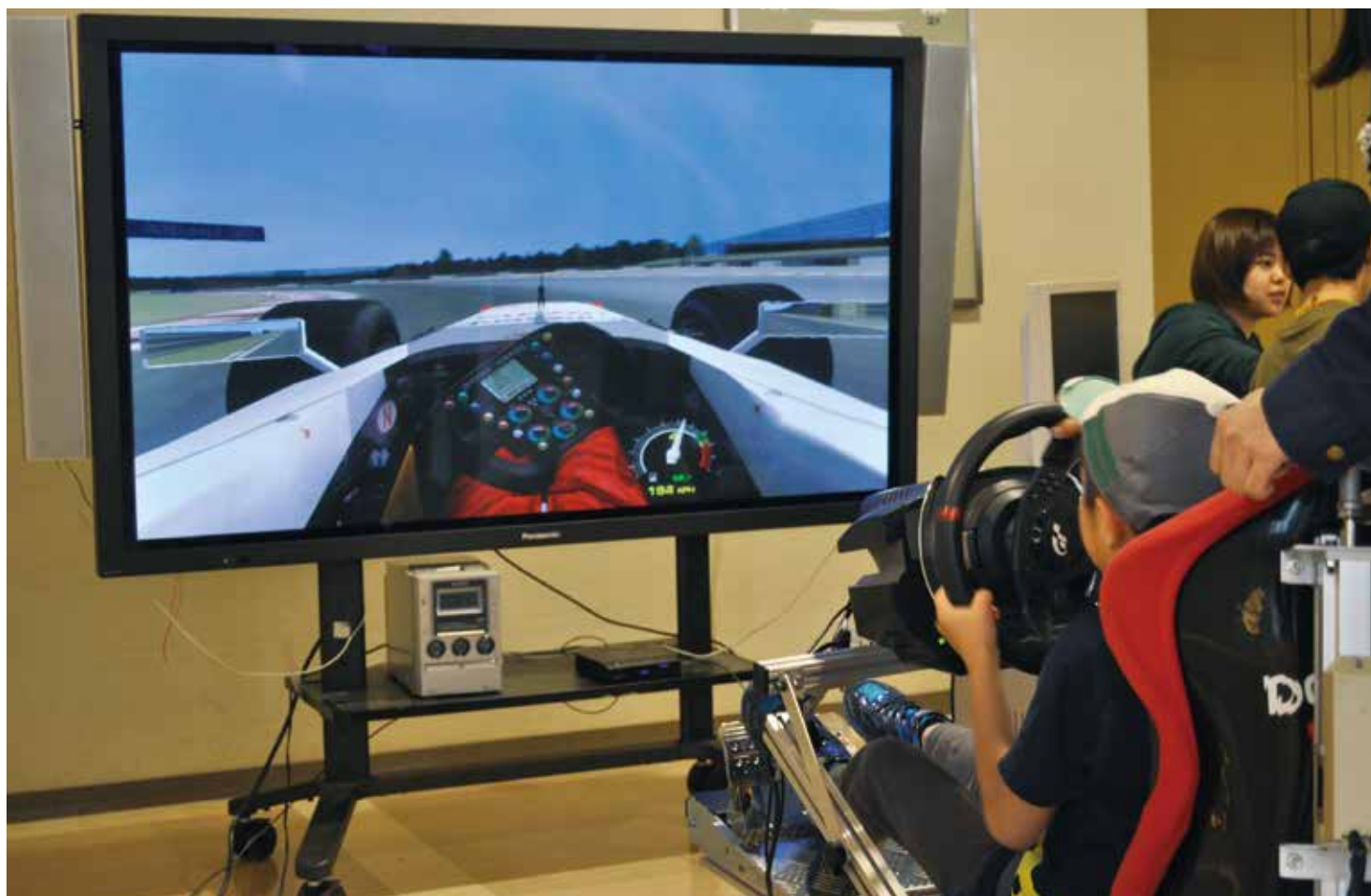
▲ A boy is playing the racing game which was made by the automotive technology study group.

On Sunday, May 21, The Kindai Science Festival 2017 was held in November hall by Student Study Groups from The School of Science and Engineering.