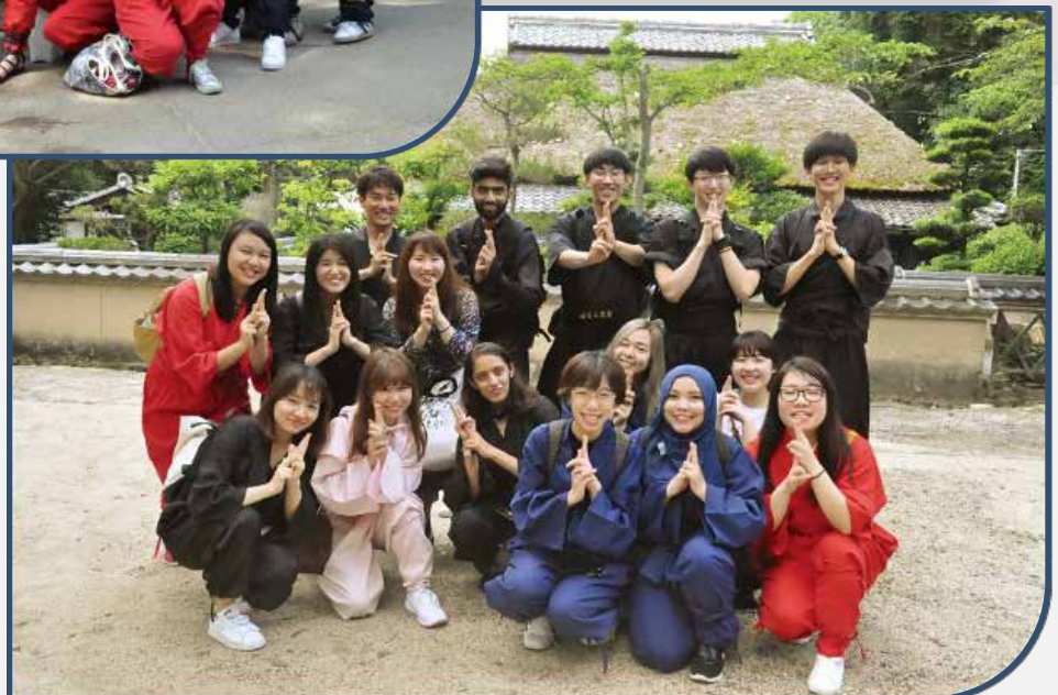
The group photo of team B. ▶ Striking up a traditional ninja pose.