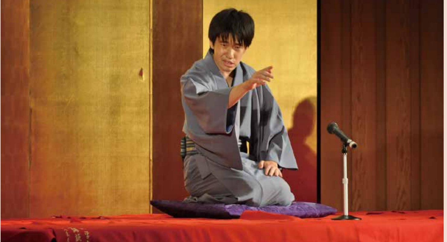
▲ Performing a rakugo expressively.

On Friday, August 4, the 50th Kindai vaudeville show was held in November Hall by rakugo and story research club. This is annual traditional event.