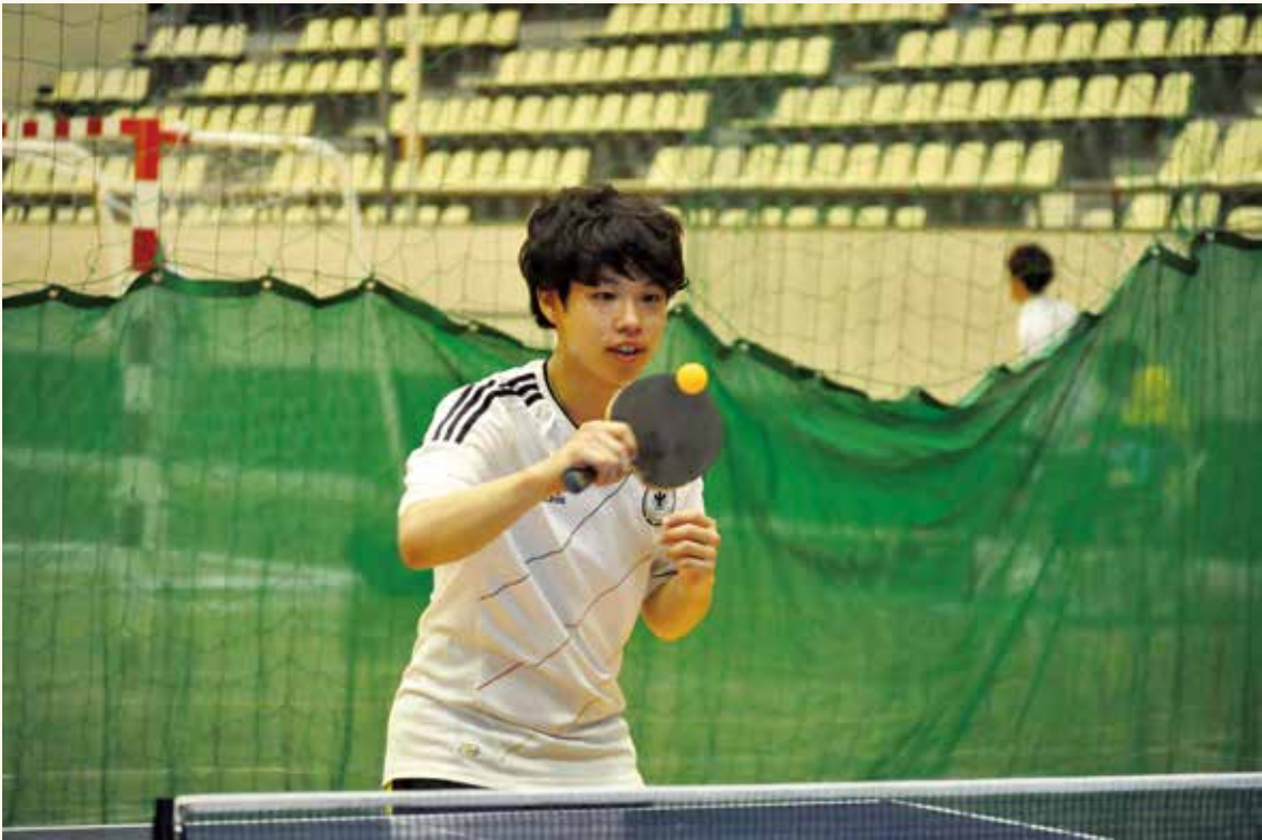
Table tennis competition. ▶