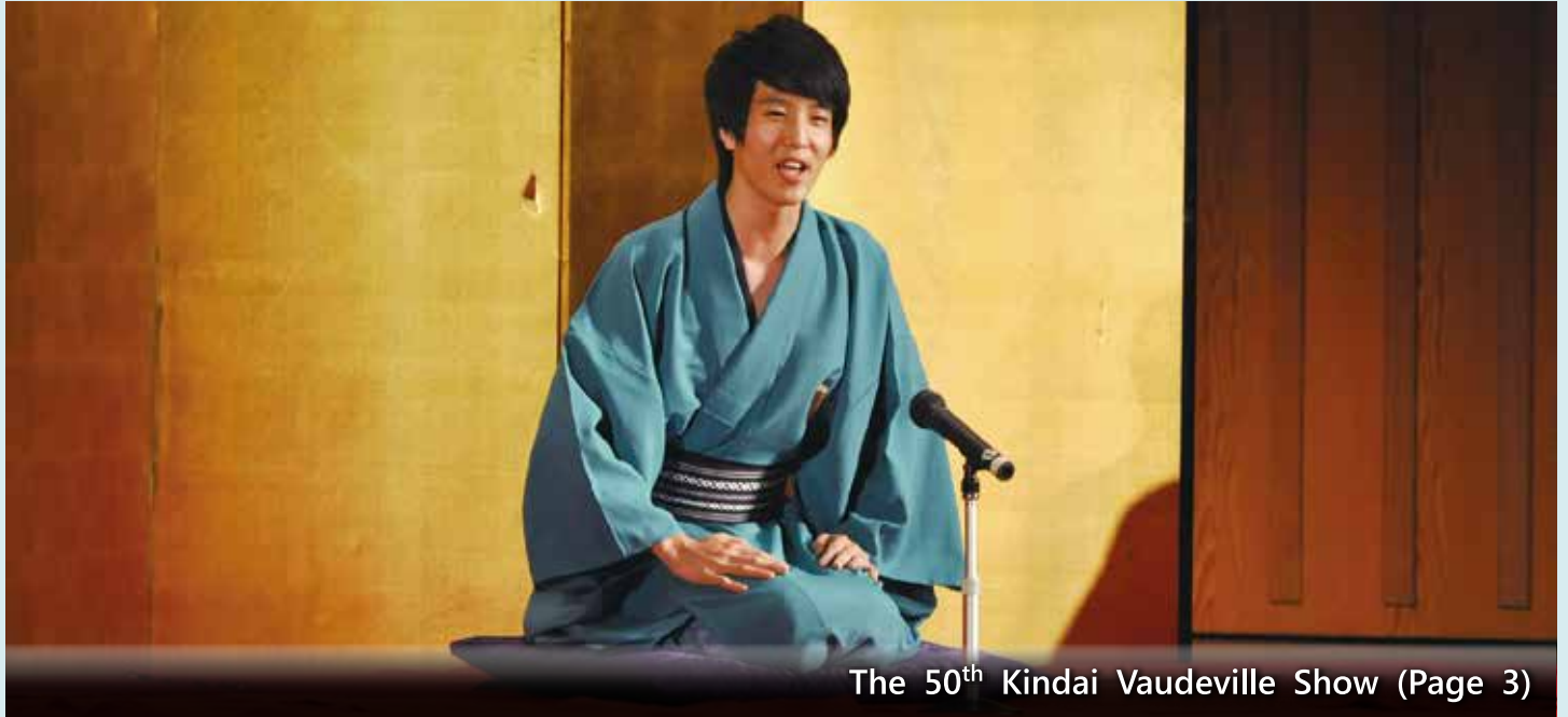
The 50 th Kindai Vaudeville Show (Page 3)