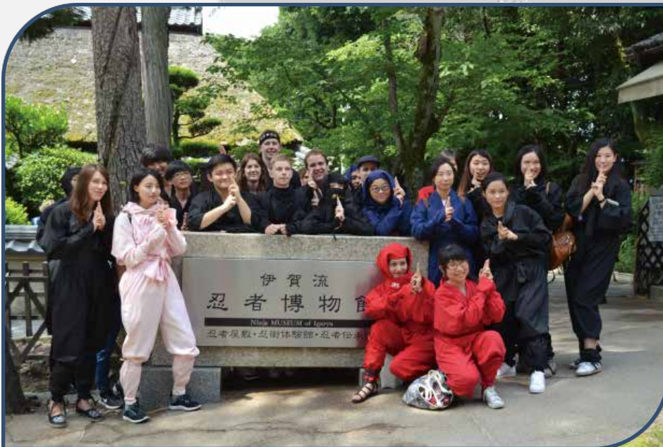
◀ The group photo of team A. The stone monument reads "Ninja MUSEUM of Igaryu".