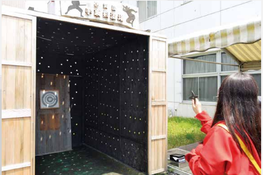
▲ Throwing shuriken at the target.

Participants deeply understood culture of Iga-ryu Ninja through not only listening to the lecture but also experience of a trial session.