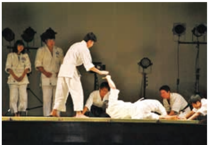
Aikido Club members perform martial arts moves.