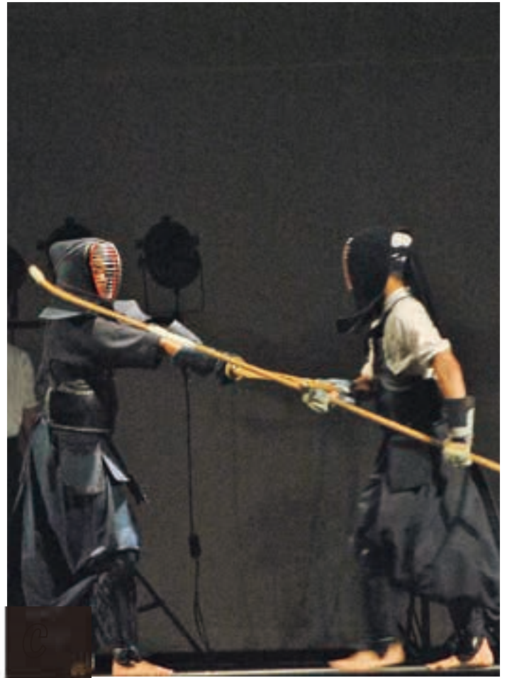
Members of Kendo and Naginata clubs take part in a practice fight.