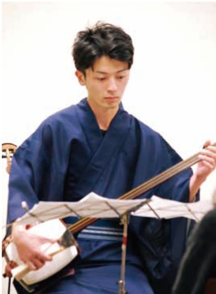
Another club member plays the shamisen very well.