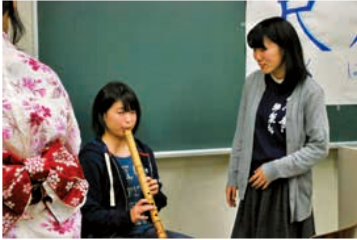
Japanese Music Club member teaches a visitor the shakuhachi .