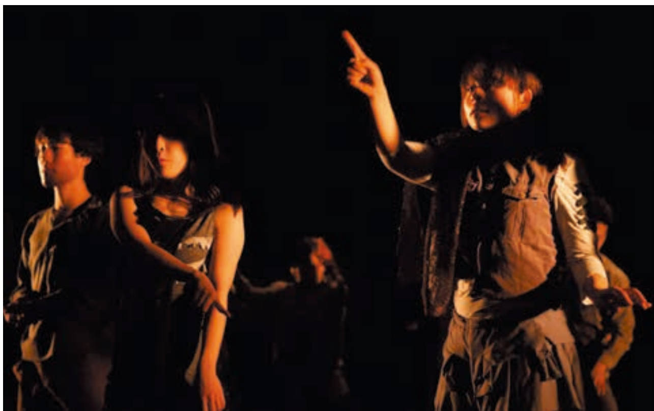
They move as they think.