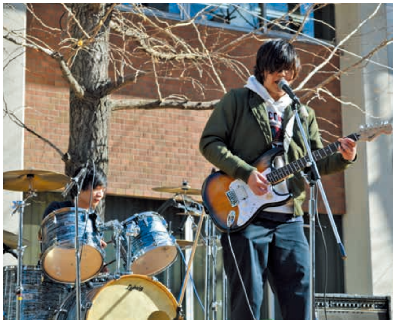
He is singing a song even in the cold weather.

concert performed by bands made of six pairs. Each band was formed when they saw a flyer and poster promoting the event. We