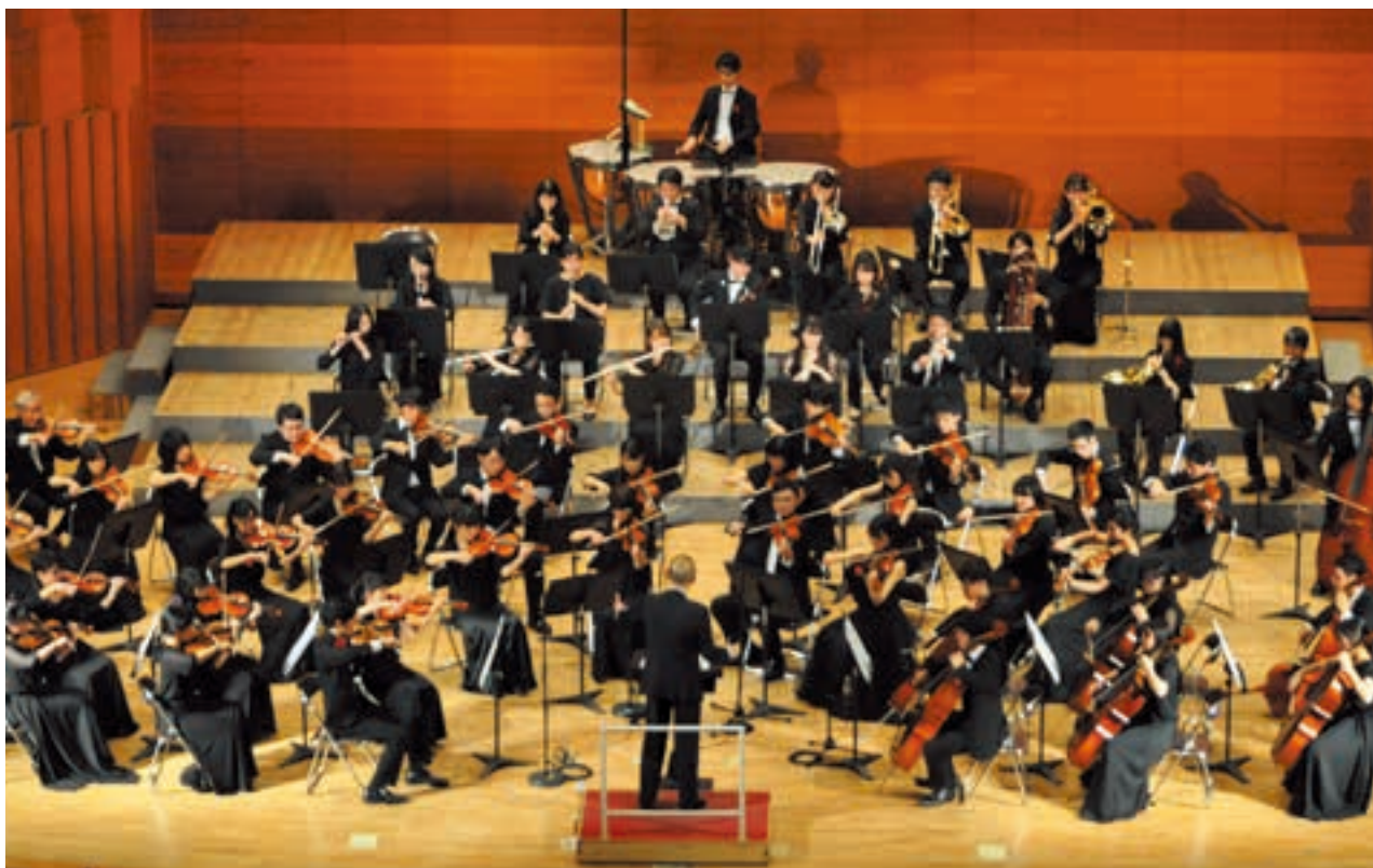
The last performance for seniors.

little anxious. However, I would like as many people as possible come the next concert because it is indispensable for not only players but also audience.”