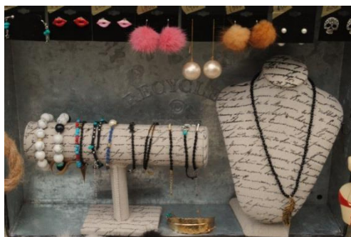
Many kinds of accessories.

There is a shop called Haghis selling accessories every Wednesday only limited to Kinki University Street. It began with rope bracelets, bracelets with straps and, bracelets utilizing natural stones. We are now selling accessories, such as necklaces. Also, they have