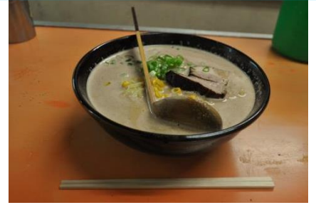
It's Mansaku Ramen.

closely associated with students. However they expressed “graduation” because they were finishing it – like a student. They left Kinki University Street thanking the many people who came to eat Mansaku Ramen .