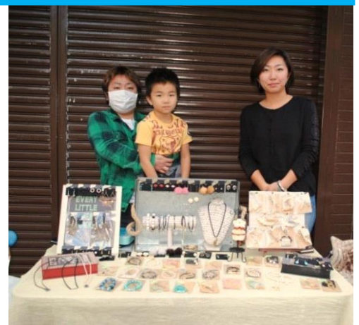
They are Haghis clerks.

Haghis opened in May of this year. They must prepare and concentrate daily, creating new inventions in order to satisfy their many customers. The small shop has continued to be