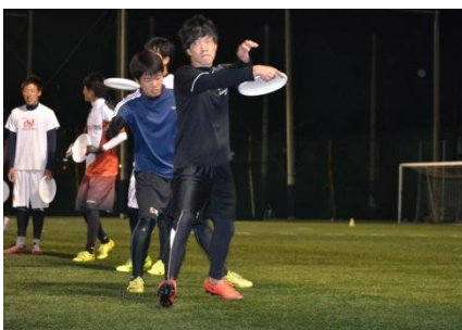
They practiced passing a disc.

After dark, club members practiced throwing plastic disks around on the athletic field. They were the Flying Disk Club members. Now they have two consecutive titles with first and second year students in November. They play on the court from 6 p.m.