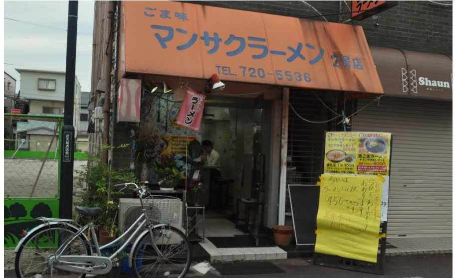
They offered Mansaku Ramen to customers for 33 years.