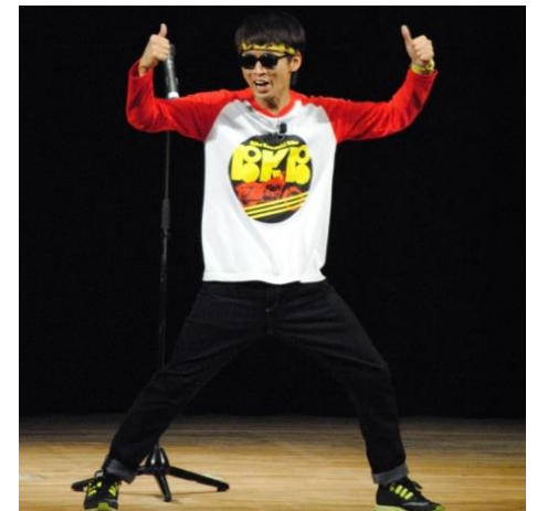
It was excited performance.