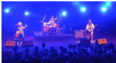
The live was heat up by SHISHAMO.

"Having seen the stands and events of the Ikoma Festival, we realize that it is because there are cheerful students that the festival is a success. We hope that the festival will continue to be held every year." In addition, donations were collected at the charity concert. This fundraising will be donated to the Tohoku district as reconstruction contributions for the relief of the Great East Japan Earthquake.