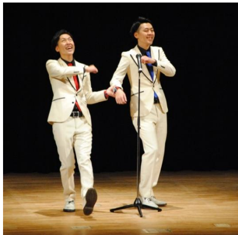
They were very funny comedian.