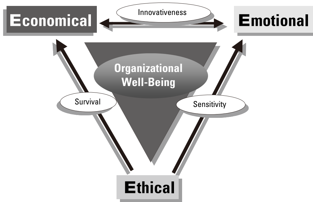
Figure 2: Dolan's 3Es tri-axial model of culture

easy matter for executives of any firm to decide what element in cultural survival is the most important, what facet is pivotal, and where to concentrate their efforts. The present mismatch between money values and ethical values is one reason for the growing interest in business ethics. Practical questions for discussion and study on business ethics should therefore include whether and how the mismatch can be rectified or at least reduced.